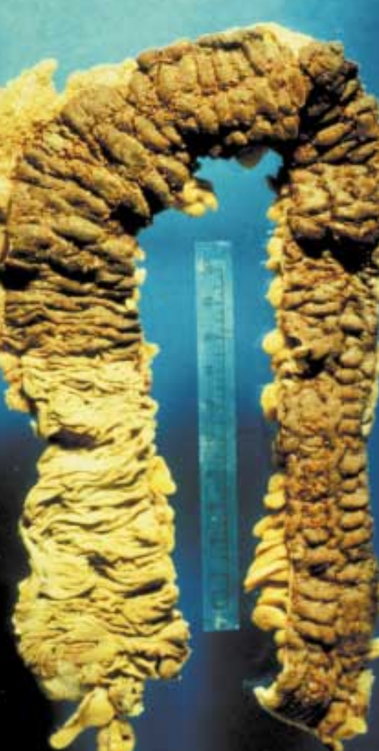
Diseased colon removed from a UC patient