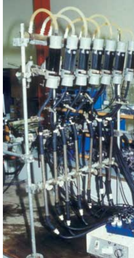
Industrial biofilm generator at NCIMB

This team has been brought together to harness the necessary range of skills to discharge the aims of the project. Expertise in areas of human gut microbiology, laboratory biofilm generation, state of the art molecular and microscopic technologies and food encapsulation and delivery systems will all contribute towards the development of new or novel treatment protocols as part of 21st century healthcare.