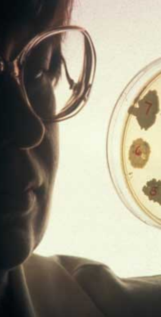
Visualising gut microbes- courtesy of NCIMB - courtesy of NCIMB Molecular analysis using taqMan at CCFRA